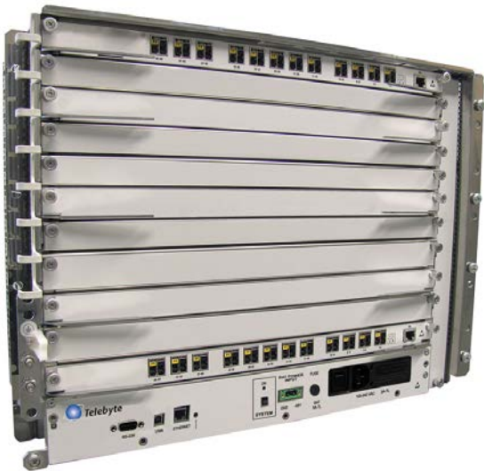
The VxT-48-DC+ (48-Channel xTalk Emulator)