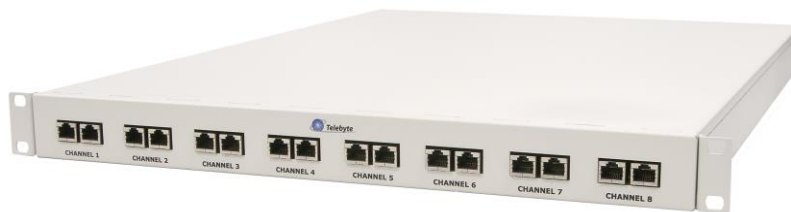
Model 800-8-212-TP100-25 (8 Channels, 25m, Fixed Length)

Ideal for testing Gfast Profile 106 and Profile 212.